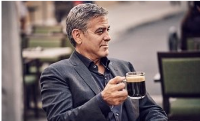
George Clooney is now global brand ambassador for Nespresso.