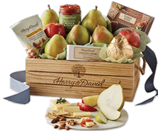
Sample Harry & David Gift Basket